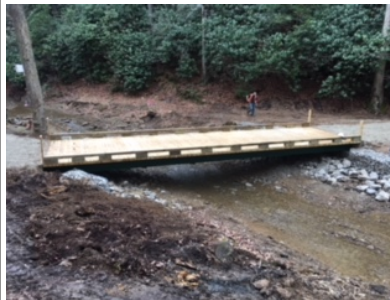
The WV VOAD Bridge Project's 50th bridge was completed this month in Ivydale, Clay County.

Funded by the West Virginia Conference of The United Methodist Church, the Ohio Conference of the United Church of Christ, the Episcopal Diocese of West Virginia and Presbytery Disaster Assistance, the project was for a family whose private access bridge was destroyed in the June 2016 flood. The homeowners have been without safe, reliable access to their home since the previous span washed out and were stretching an extension ladder over a creek to cross.