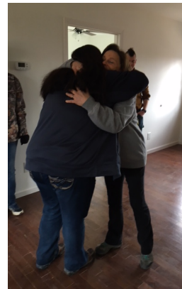
A Clay County family moved into their new home this month after living with relatives since their Precious home was destroyed in the June 2016 flood.