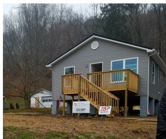
Multiple WV VOAD member agencies, along with other local community groups, contributed funding and helped with the labor on this new Rainelle home.